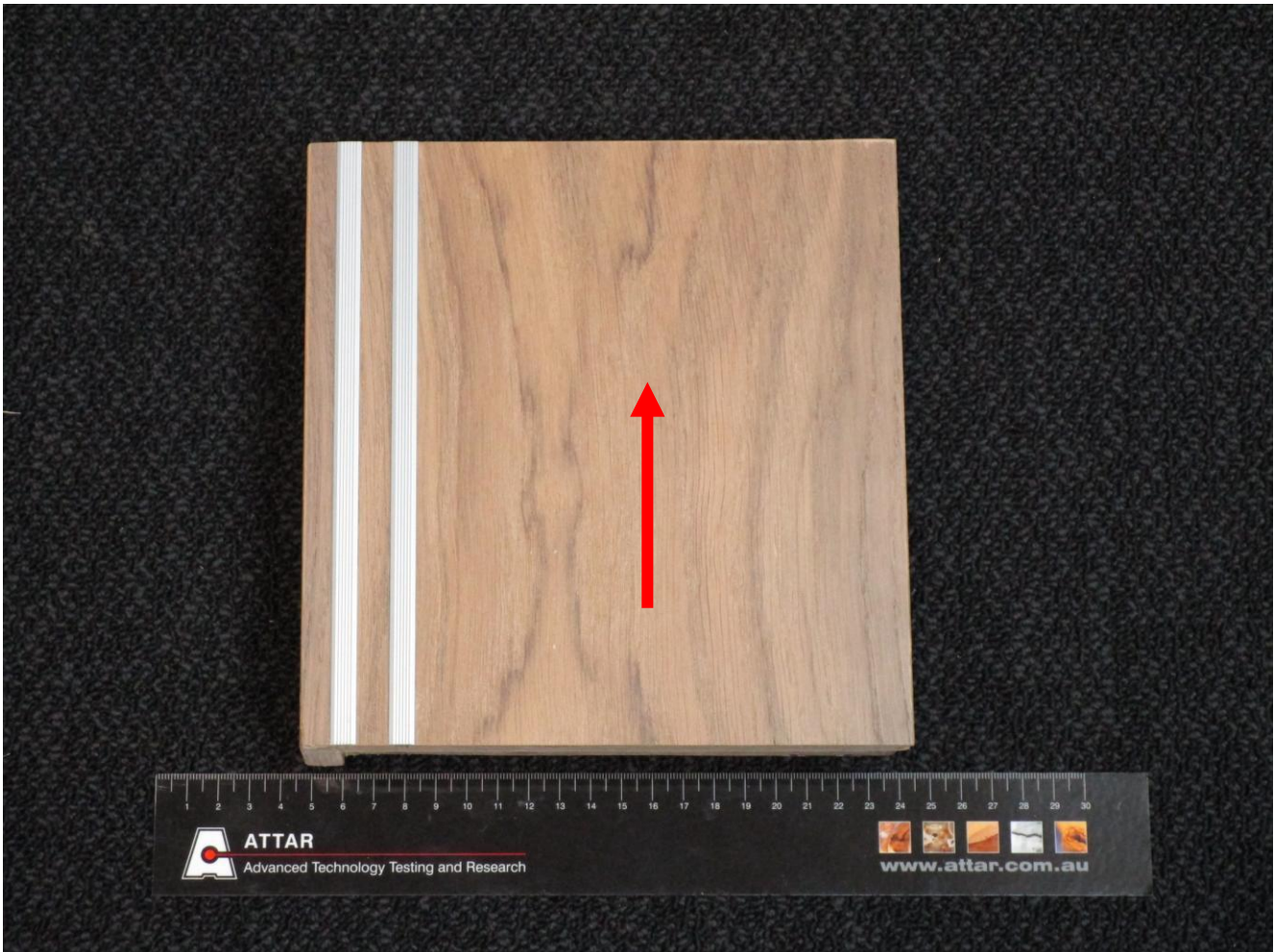
Figure 1: Sahara Oak. Arrow indicates direction of test.