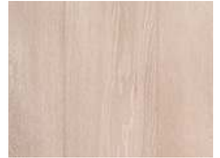
BEACH COTTAGE Limed-Stained, Lightly brushed, UV Lacquer Invisible Coating