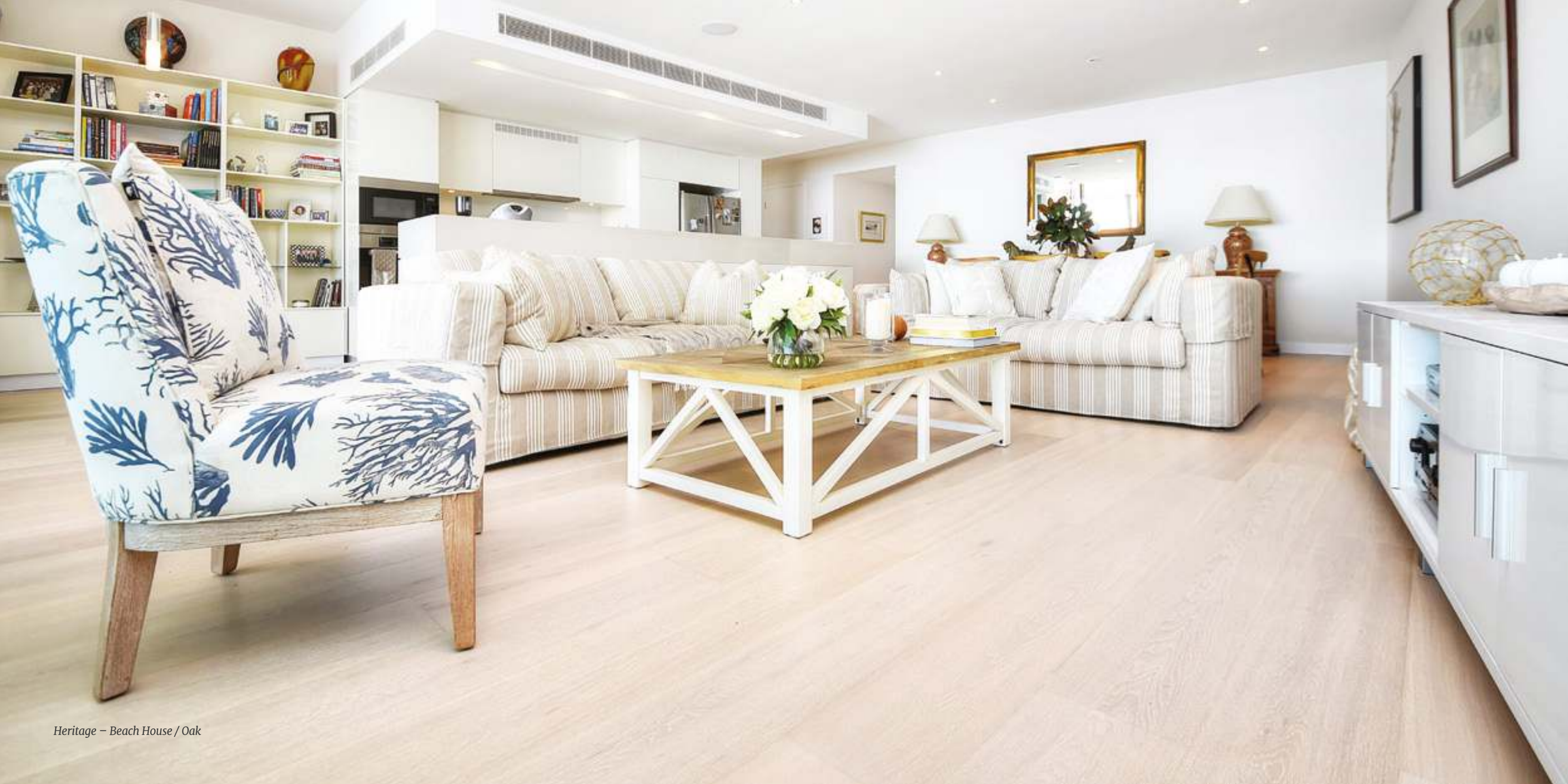
Heritage – Beach House / Oak