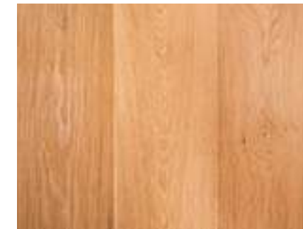
WARM OAK Smoked, UV Lacquer Invisible Coating, 40% Satin Sheen