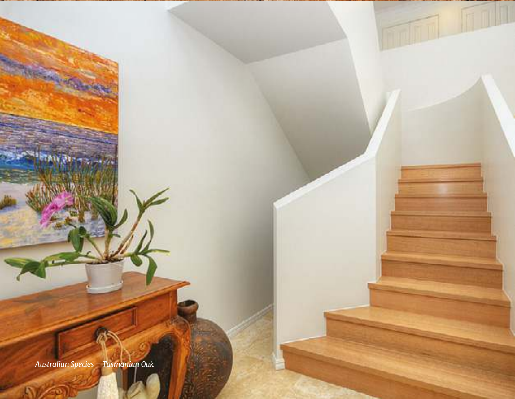
Australian Species – Tasmanian Oak

There is nothing better than real timber floors