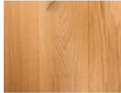
SAHARA OAK Smoked Slightly, Brushed, Stained, UV Lacquer Invisible Coating