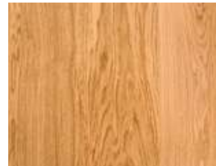
NATURAL CASTLE OAK Lightly brushed, Rustic, natural invisible coating ABCD grade