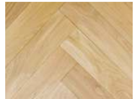
NATURAL OAK HERRINGBONE Smoked Slightly, Brushed, Stained, UV Lacquer Invisible Coating