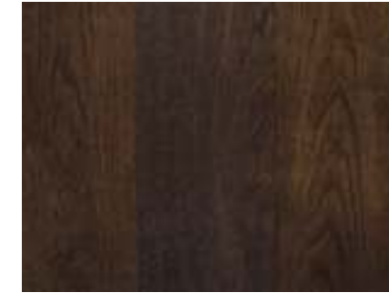
EXPRESSO Brushed, Stained, UV Lacquer Invisible Coating