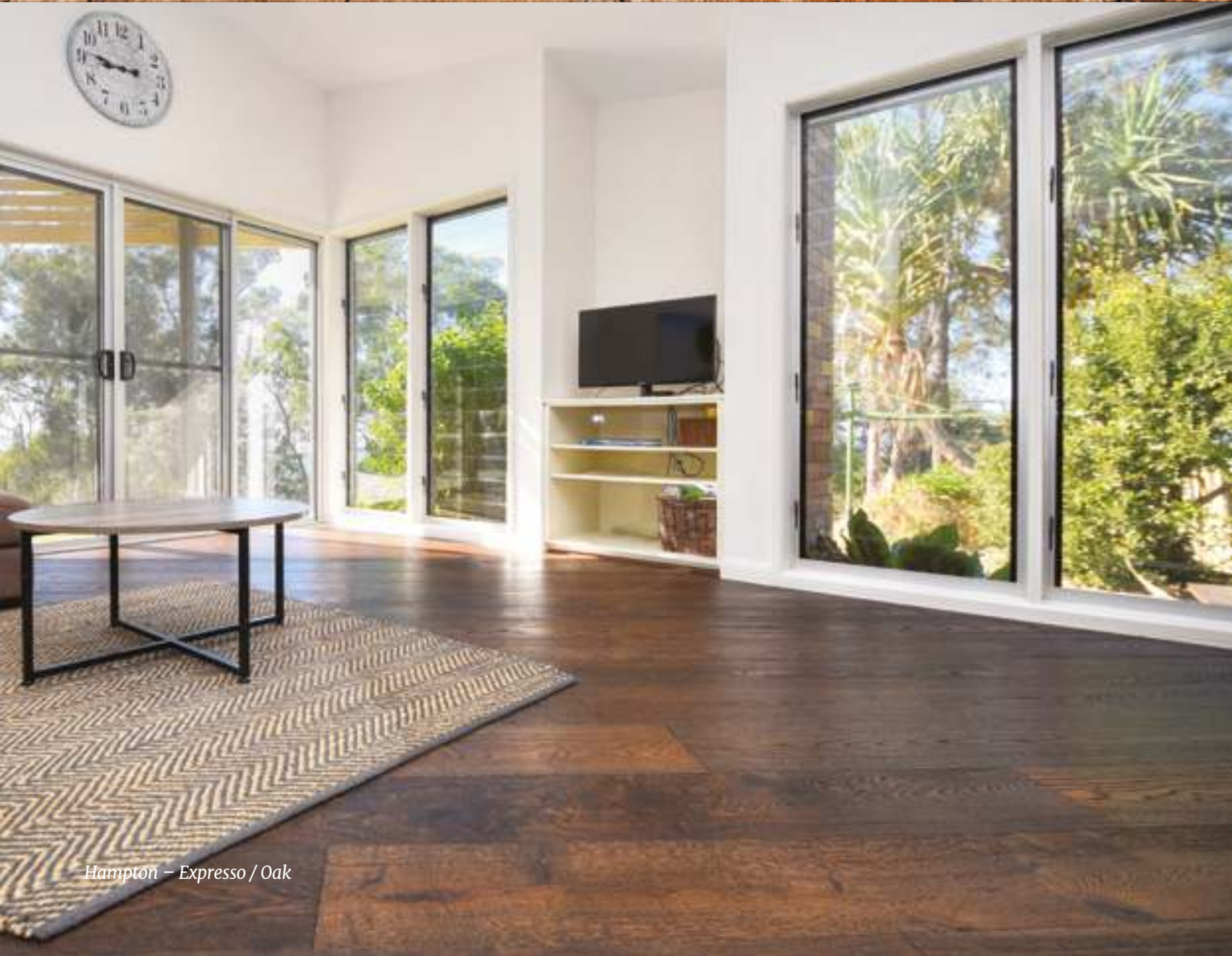
Hampton – Espresso / Oak

Why choose an engineered timber floor over a traditional solid timber floors