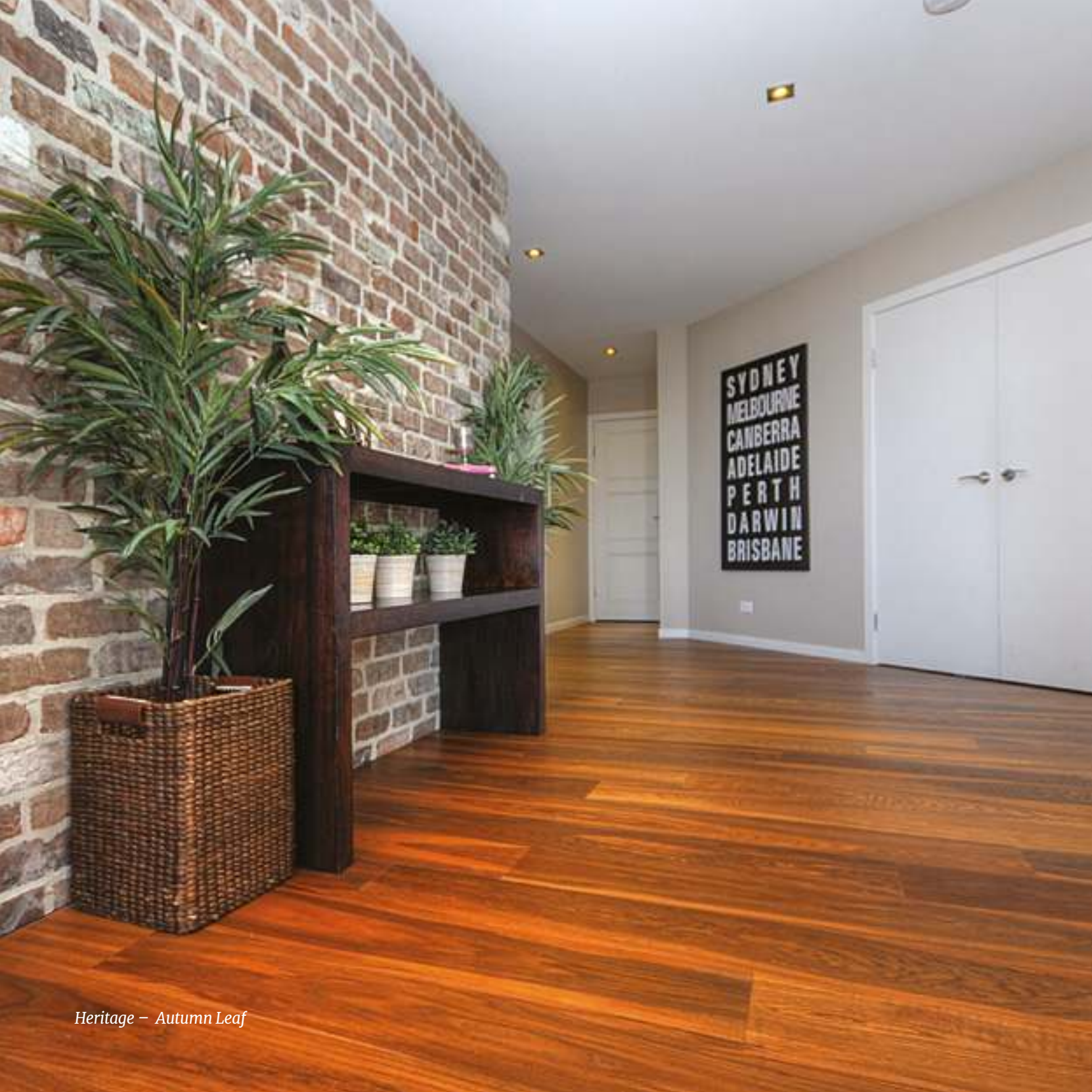
Heritage – Autumn Leaf