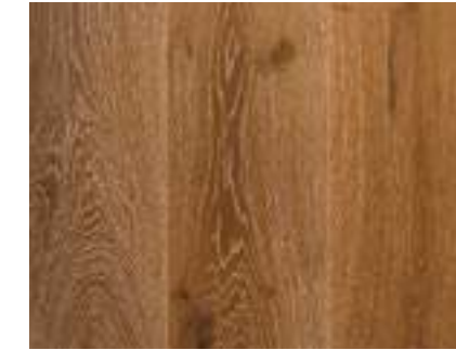
BROKEN BARK Lightly brushed, stained, smoked, light limed washed with invisible natural coating