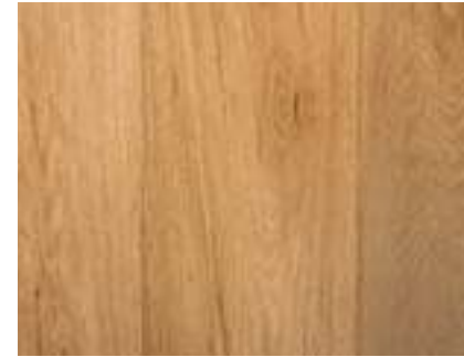
DUSTY CLOUD Lightly brushed, light limed washed with invisible natural coating