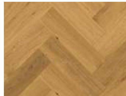
SAHARA OAK HERRINGBONE Limed-Stained, Lightly brushed, UV Lacquer Invisible Coating