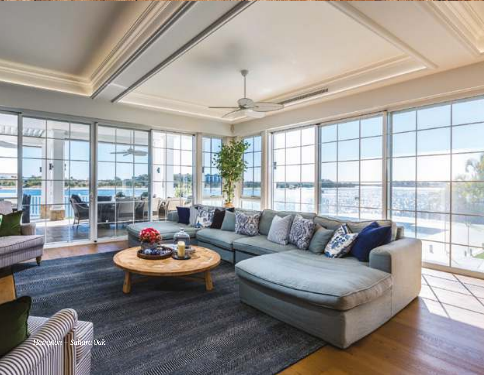
Hampton – Sahara Oak

Harmony Timber Floors are harvested from Legal sustainable forests. The floors are engineered with a Hardwood Top Layer of solid timber, known as a lamella, the Lamella is sawn which gives you an exact look and feel of solid timber, the surface can be re-sanded as you would a normal solid floor, however the benefits of an engineered floor far outweigh those of a solid timber floor.