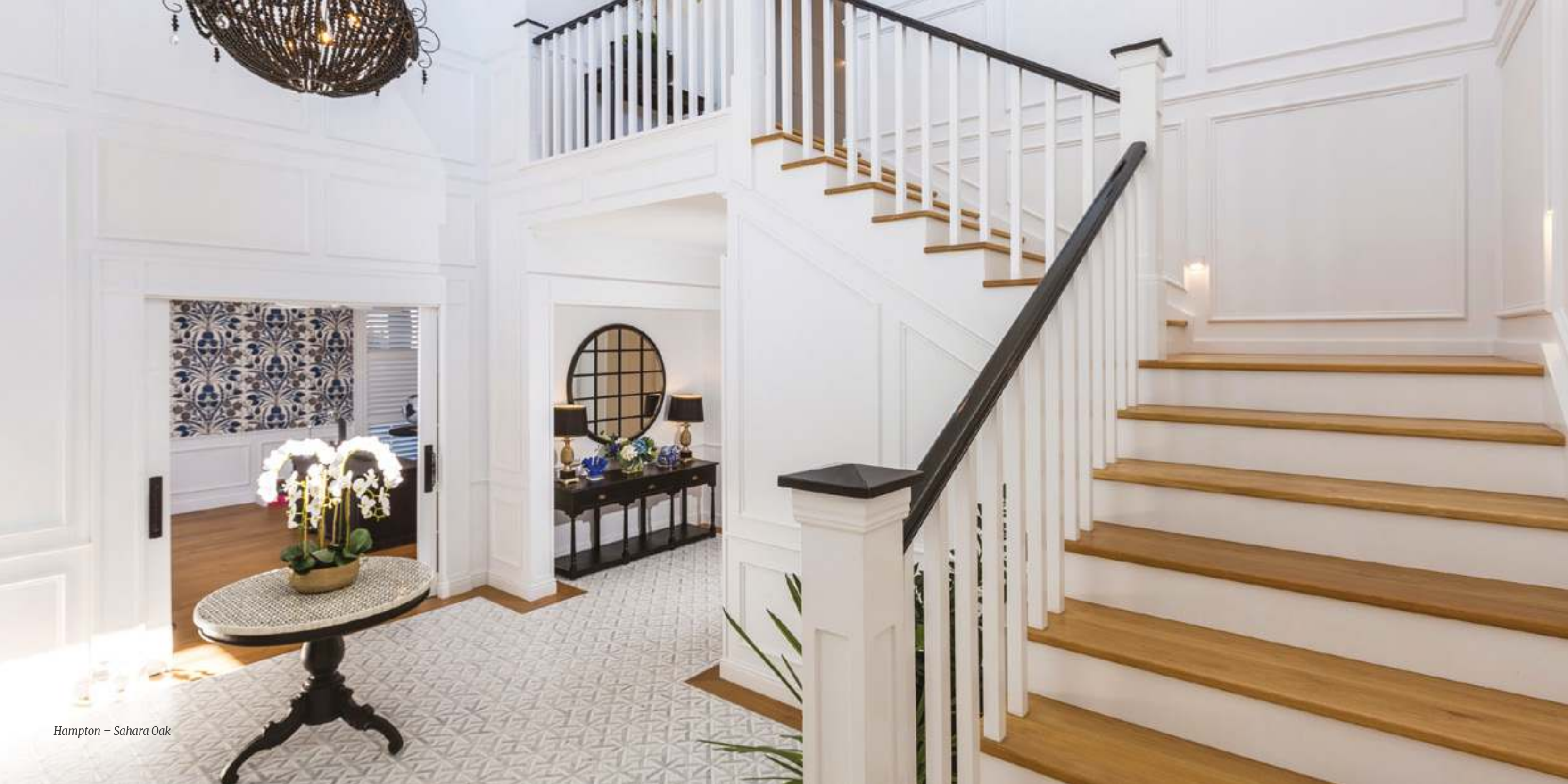
Hampton – Sahara Oak