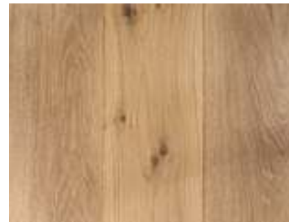
ISLAND SANDS Limed-Stained, Lightly brushed, UV Lacquer Invisible Coating