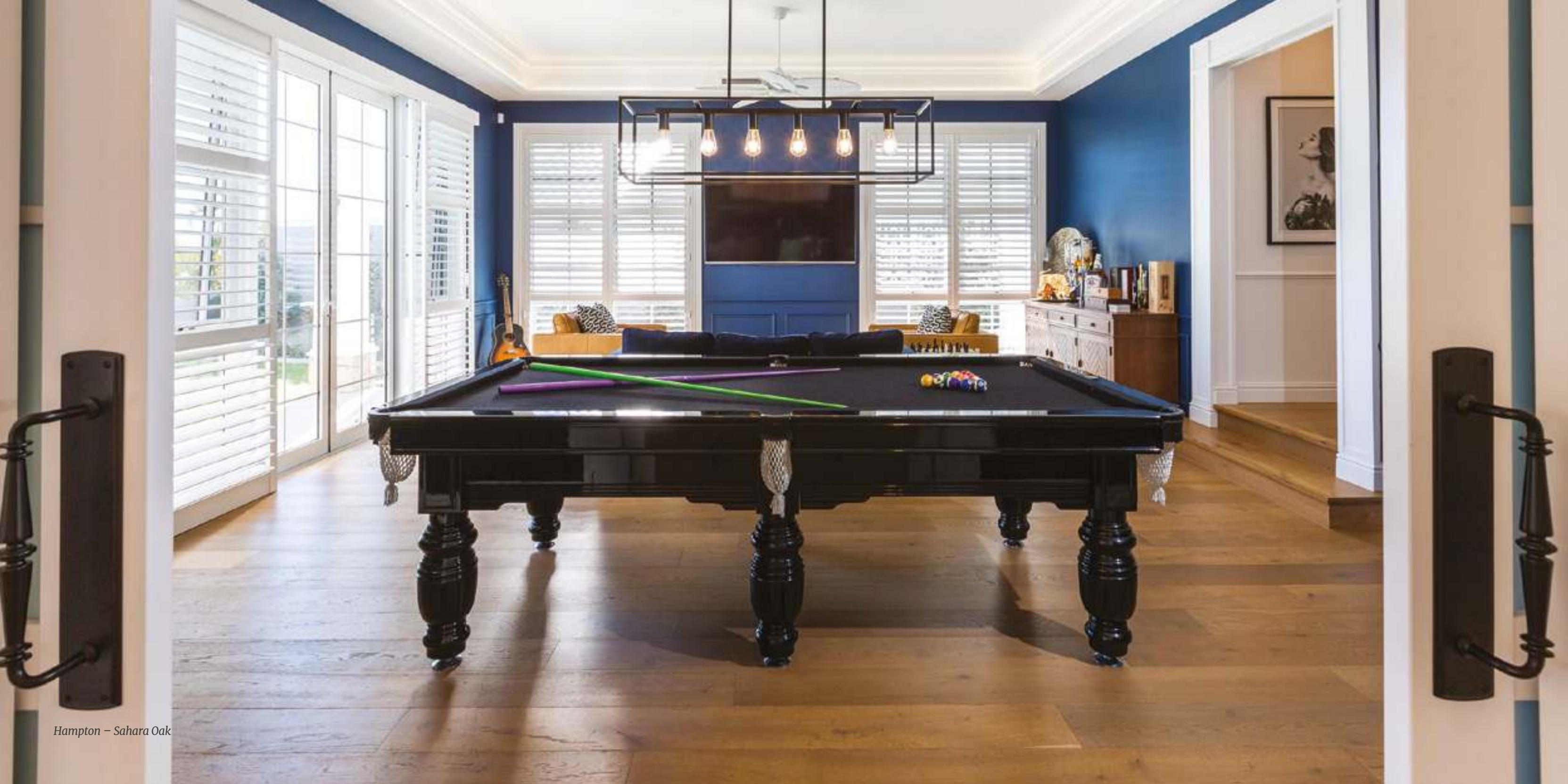
Hampton - Sahara Oak