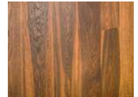
AUTUMN LEAF Lightly Brushed, natural stained, Invisible Coating