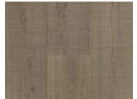
GREY OAK Smoked Slightly, Brushed, Stained, UV Lacquer Invisible Coating