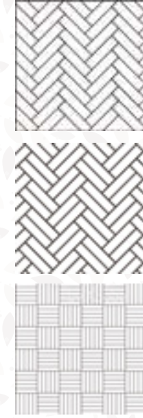
HERRINGBONE: 15/12x125x900 Custom Size Available