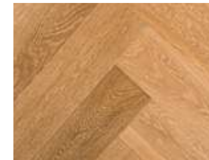
HERRINGBONE - DUSTY CLOUD Lightly Brushed, light Limed washed with Invisible Natural Coating