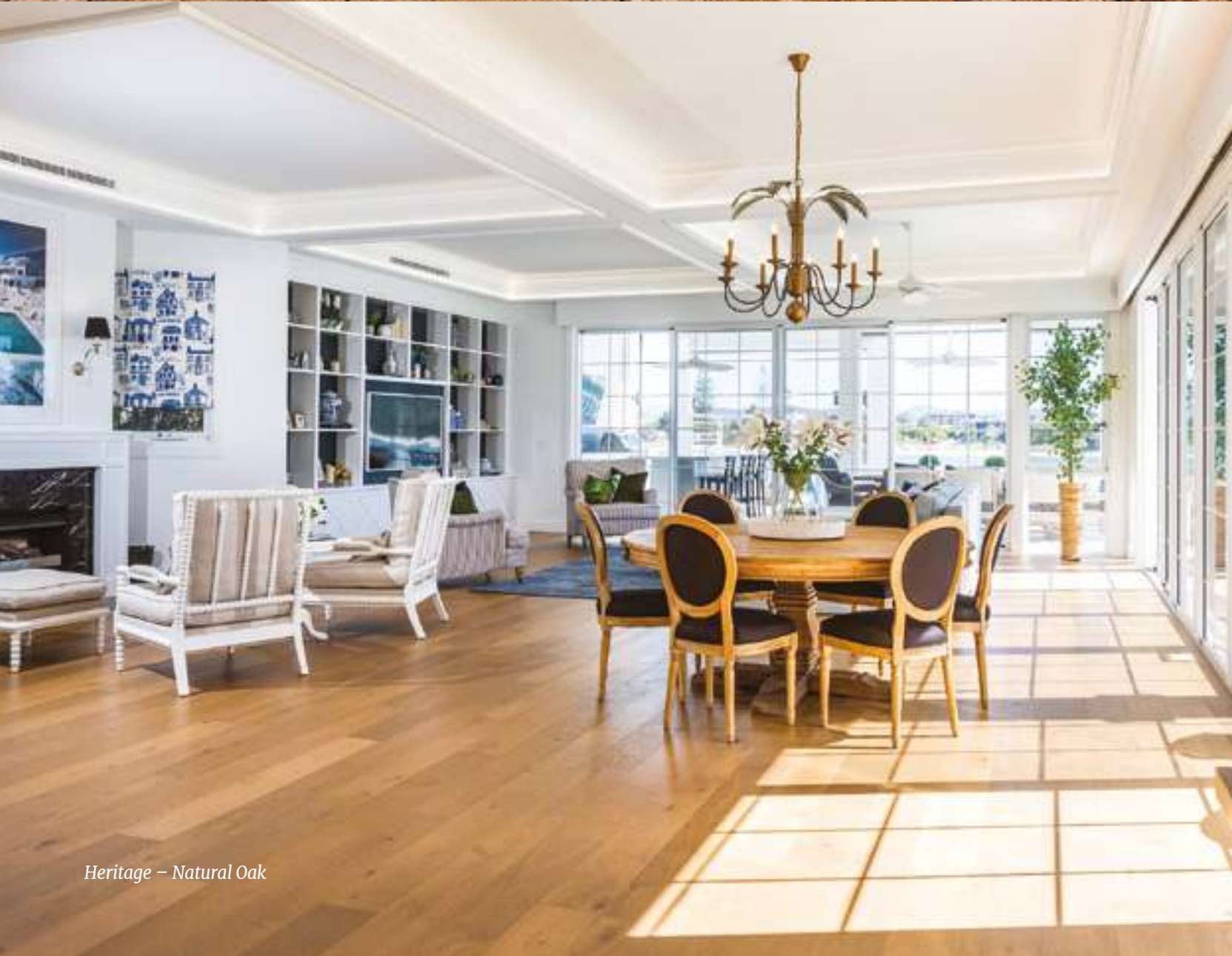
Heritage – Natural Oak