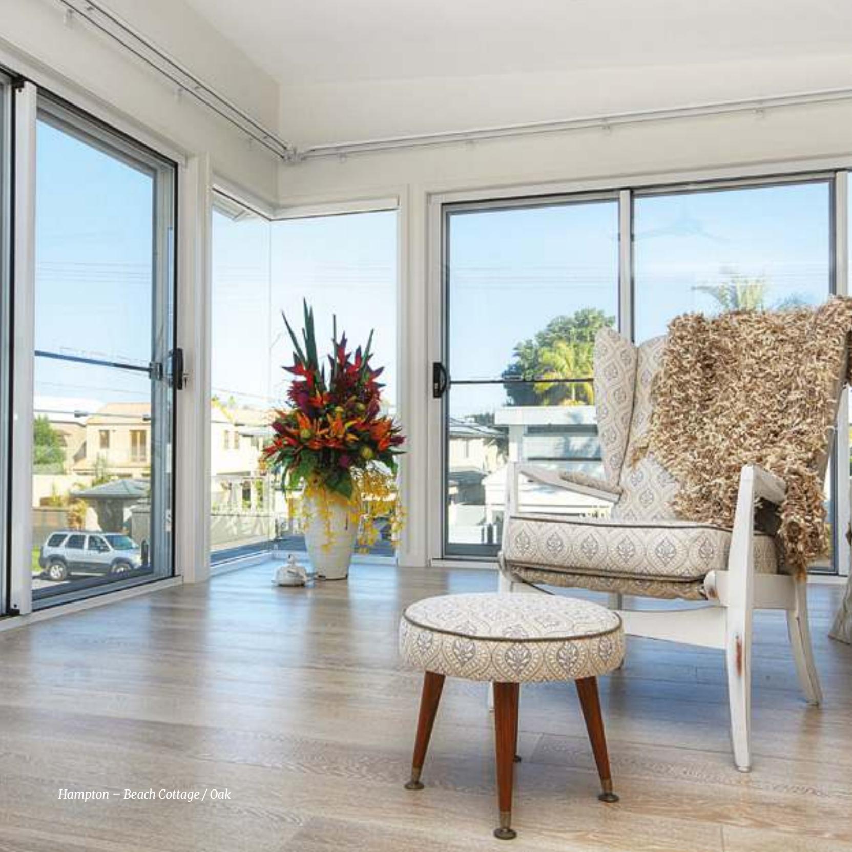
Hampton – Beach Cottage / Oak