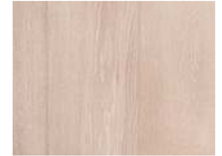
BEACH HOUSE Lightly brushed, bleached white, limed washed with invisible natural coating